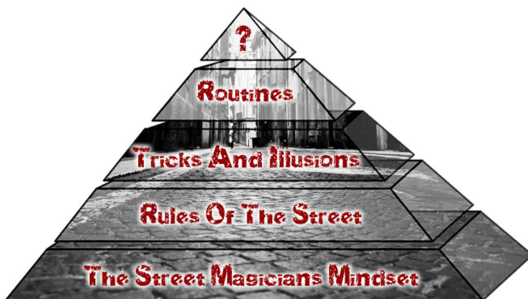
The Street Magician's Pyramid Of Success

It consists of 5 main levels and can be graphically represented as the following pyramid: