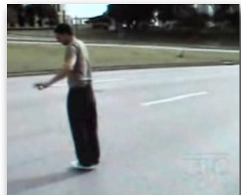
David Blaine levitating on the street

It was a Friday afternoon and after watching that clip and realising how cool it would be to do the same tricks David Blaine was doing, I said to my friend that I desperately wanted to get back into magic again.