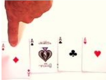
diamond chosen = no change

These photos show each of the four possible outcomes.