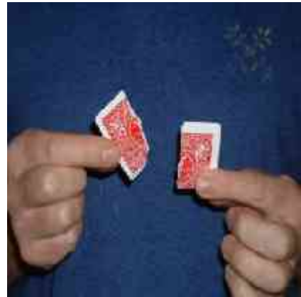
6) Fold third half of card.