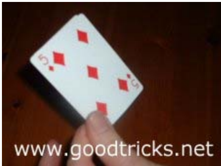
Fig 2 : The double faced card(s) (are held between thumb and middle finger. They should stay together with practice and be seen by the spectator to be one card. Practice holding hand at slight angle to hide other side of card(s)