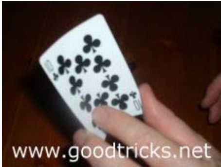
Fig 1 : Holding the double faced card(s), press the centre of the card(s) with your second finger, the side of the card held by your middle finger should be allowed to slip free and the card(s) snap round to be held between your thumb and middle finger.