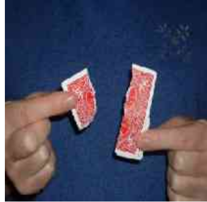
5) Fold second half of card.