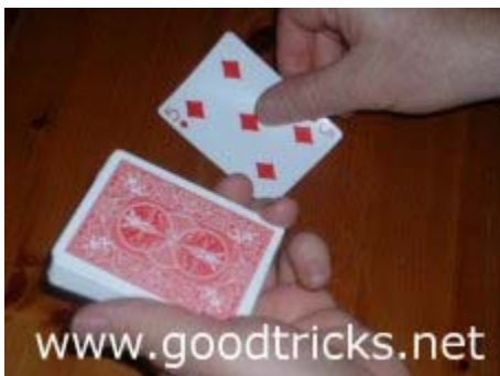
Fig 4 : Take the top card and place it on the table. Cut the deck to hide the other card used in the double faced pair.