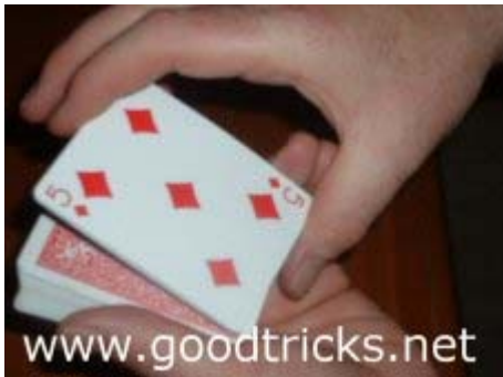
Fig 3 :Place the double faced card(s) on top of the deck.