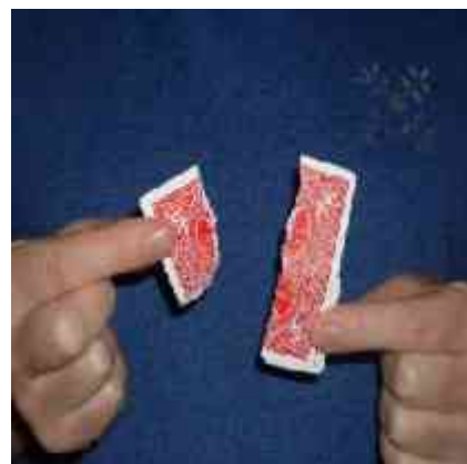
4) Present "torn" piece to audience.