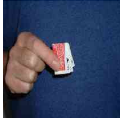
2) Fold card into fourths.

Fold what is now the lower right corner behind the card. As you are bending this piece back, slide the extra piece into view again, pretend to tear it off. Place it behind the card and fold the card in half again. (really it is still together) Pretend to tear it in half again, but just slide the loose piece off the pile convincingly to look like it has just been torn. Place the piece behind the card which is now folded up. Now even though the card is not torn into pieces, you can fan the folded card to make it look like it is in several pieces. Ask a spectator to place their fingers on the "torn" pieces. As you set the pieces on the table, steal the loose piece with your thumb and hide it in your hand by using a finger palm move Misdirect and place the loose piece in your pocket. Now ask the spectator to examine the card and they will find it is in one piece.