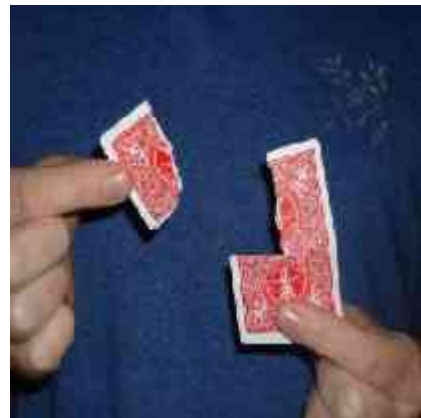
3) Hold extra piece in place with thumb.