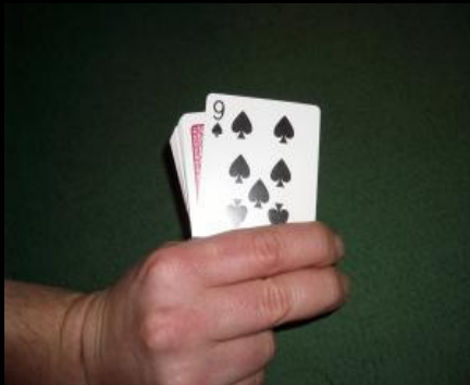
Audience's view (card moved to side to explain, in position for trick)

The magician riffles through the entire deck in a fraction of a second and looks at all the cards. A tells everyone that he now knows the order of every card in the deck! The first card is easy as everyone can see it, so says, 3 of diamonds. The deck is then put behind his back and the front card is put to the back and the deck is brought back out facing the audience. The new front card is correctly predicted. Again the cards are put behind the magicians back and the front card put to the back, brought out and correctly identified. The magician repeats this until everyone is satisfied that he knows the entire deck!