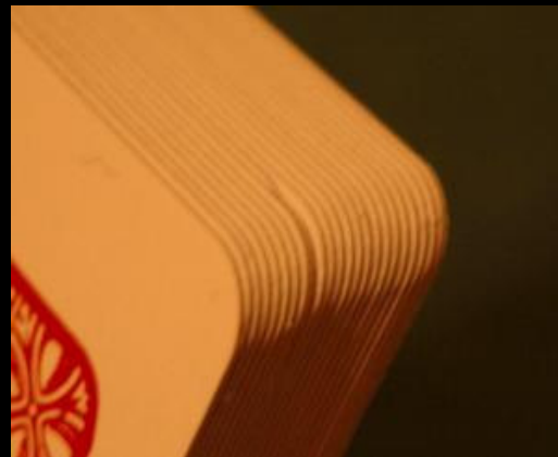
Spotting their card

Before you perform this trick you need to modify your deck of cards. Take a pair of nail clippers and cut the corner off one card, not too much just increase the radius on the corner slightly. Then repeat on the opposite corner of the same card. Ensure this card is at the bottom of the deck and when you shuffle and make sure it stays at the bottom of the deck. When you perform the trick the selected card will be below this modified card (when the deck is face down). You can then throw out on to the table the selected card.