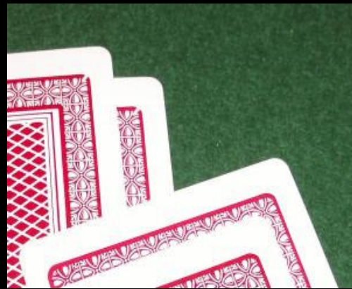
The red black sort, one set with cuts in the top right, the other without

Again you will need the directional pack of cards we made in the previous trick, 'One – Way Cards'. Start with them all in the same direction, mixed up. Sort into the two piles, when you riffle shuffle turn one set through 180 degrees so when they mix the red and blacks are in opposing directions. Shuffle over hand as much as you like and then sort into piles using the direction markings.