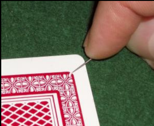
Modifying the cards, remove top right border on all cards!

This trick is very similar to the 'Cutting the Corner' trick but is done in a different way and may be simpler to perform.