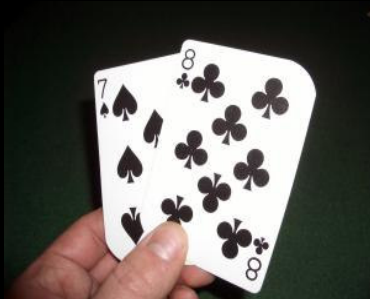
Your two cards

The magician passes you two cards and asks you to return them to the deck he is holding anywhere you like. They can be together or apart. As you are about to place them he says, 'I hope you remembered them?'. You take another quick look and place them in the deck. He then taps the deck on the table to make all the edges neat, telling you it disguises the location of your two cards. He then riffles the deck. Places his thumb and second finger on the top and the bottom of the deck whilst holding the deck firmly in his other hand and then snaps your two cards straight out of the deck!