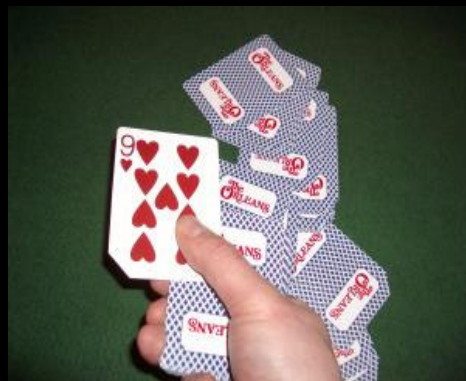
The drop cut and display of chosen card

The secret has something to do with the magician putting his fingers on your card! You need a few grains of salt on your finger tips, then when you remove your fingers a few remain. This will be sufficient to make the cards split at this position.