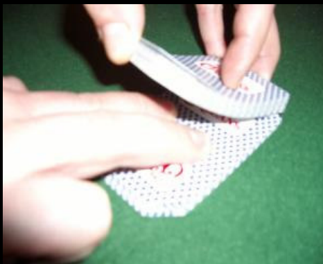
Salt grains being left on the surface of the chosen card

The magician takes a pack of cards face down and riffles through them and asks you to say stop. You are then given the choice of the card at the split or the next one above. You take this card and remember it whilst the magician puts both halves of the deck on the table. You then have the choice to place your card on top of any one pile. The magician then puts his fingers on your card to hold it in place and puts the other pile on top and removes his fingers just in time. He picks up the deck and riffles it. Then lays it flat in his palm and pushes his arm forwards so half the cards fall on the table. The top card in the magicians hand is revealed to be your card!