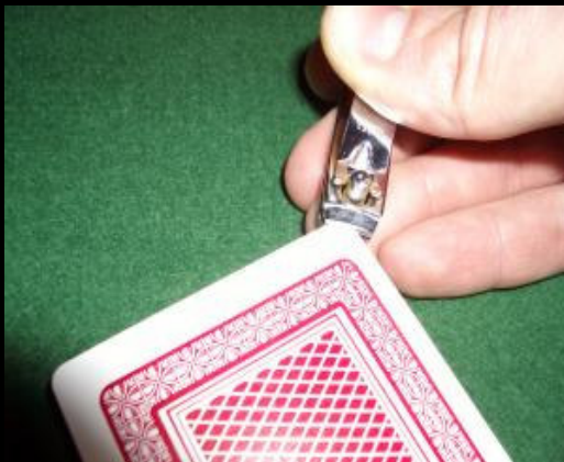
Modifying the card

The magician shuffles the deck and places it on the table, face down. You are then asked to cut the cards and place the two piles side by side. Pile 1 are the set that were on the table originally, and pile 2 are the cards moved off the top. You are then asked to take the top card at the cut position which is the top card from pile 1. You are asked to remember this card, then you place it on top of pile 2. Then finally you are asked to place pile 1 on top of pile 2. The magician takes the deck and riffles it, then cuts several times and instantly throws your selected card out on to the table!