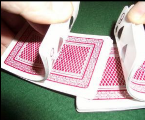
The reverse riffle shuffle, one half turned 180 degrees before shuffle.

The cards are then dealt back into two piles, face down and when turned over they are back in red and black order!