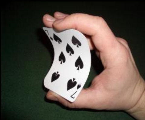
Front view of the bent card

The magician takes the top card off a shuffled and cut deck and holds it facing you. He flexes the card to determine the stiffness and feels the front of the card. He then reveals the selected card is the 7 of spades. The next card is taken, he bends the card again between his thumb and forefinger and feels the front and reveals correctly that it is the king of hearts. Finally, you are asked to take a card of your choice from the deck and pass it back to the magician. He repeats the process and gets it right again!