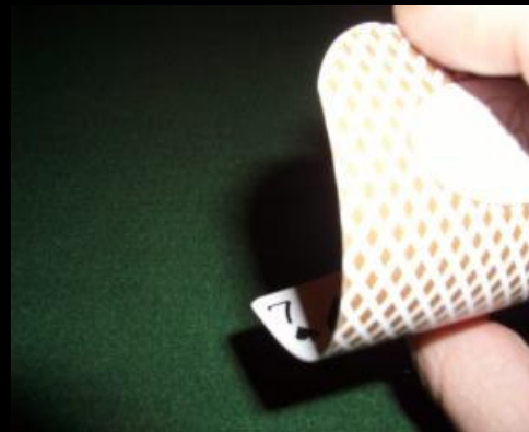
Rear View of the bent card

The secret to this trick is simple. When you flex the card in your hand, if you bend it sufficiently you can see the the bottom corner of the face of the card as show in the picture.