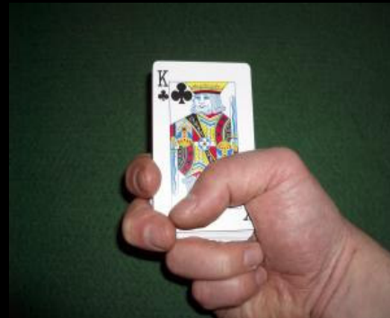
Your view of the next card

When you riffle the deck you must remember the second card, forget the rest! When you put the deck behind you the first time take the first and the remembered second card and put them face up on the back of the deck in reverse order so the remember card is now at the front. Say this card out loud. You are now looking at the front of the deck and the audience are looking at the back! You can see the next card, remember it and put it to the 'new' front when it's behind you, repeat until you have gone through 20 or 30 cards! You cannot go to the end or your secret will be revealed!