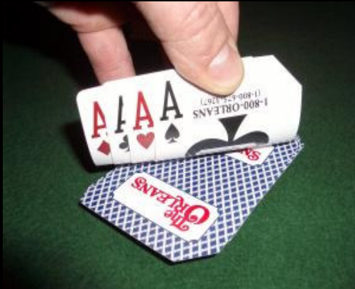
Aces on top of your deck before the start

The two halves are brought back together and spread across the table to reveal that all four aces have been selected and can be seen face up in the deck.