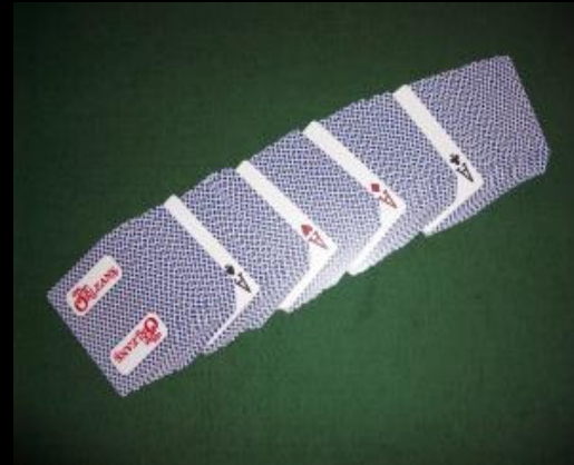
The final layout

The secret is before you start the trick have all four aces in your back pocket and put them on top of the deck you keep. When the volunteer gives you their card give them an ace, and put theirs on the bottom and take another ace and place it in your deck face up. Just repeat this again for the second time.