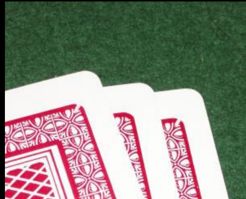
Spotting their card

Again this trick requires a modified deck. You will need a pack ideally that has a border around the pattern on the back of the deck. As shown in the picture use a pin to remove some of the ink across one corner of every card, must be one corner only! When you have your deck ready just make sure all the cards are arranged in the same direction. When the volunteer takes their selected card you turn your deck through 180 degrees so when the selected card is returned it is now the other way around to all the others. Shuffle and select the chosen card with ease!